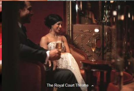
The Royal Court Theatre