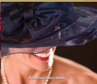
A sense of occasion